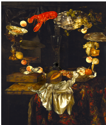
John Baldessari, Still Life, 2012

There's one app by John Baldessari. It's based on a 17th century Dutch painting of a still life. You're able to create your own art. It's from a 2001 exhibition idea that he had with the actual painting at LACMA. Next to the actual painting, he projected an antique frame of the painting, and through the computer, people could rearrange the objects. Eventually he turned it into an app that people can play with. I like how it references art history and is educational that way. Baldessari has a great sense of humor.