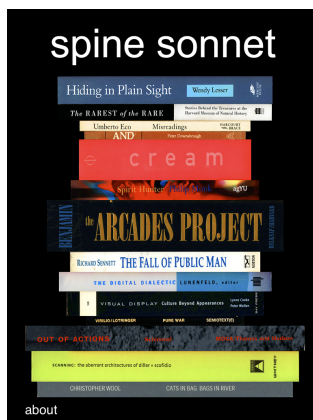
Jody Zellen, Spine Sonnet

But it's happening more and more. People all over the world can see art but not necessarily be able to get there and see it in person. I think the next generation will be more comfortable with art on computers, whether they are JPEGs or they are apps. It's all about acceptance. I feel like we're at a time where people don't and will not consider apps art. But to have the conversation "Is it art?"—to just consider maybe it could be art—I think it's just that step that's needed.