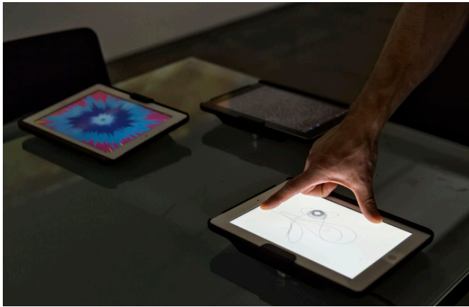
Image via the San Jose Institute of Contemporary Art / Exhibition View, Photo Credit: David Pace

Last year, Tumblr and Phillips auction house joined forces for a digital art auction called "Paddles ON!" that caused quite a buzz. The auction presented a strange situation; mostly non-physical items were being sold for similar prices as more traditional art items. For instance, a website by digital artist Rafaël Rozendaal sold for $3,500.