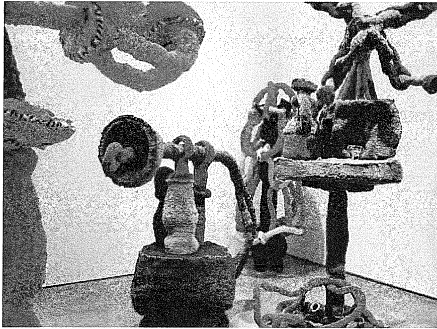
Dialator and Interrogator seem to face off in the fantasy installation of Energy Machines by Ted Fullwood.

As soft and brightly colorful as these works are in comparison to Fullwood's ceramics (See an upcoming show in City Windows Gallery for examples of Ted Fullwood ceramic sculpture), there are many whimsical forms and playful shapes in the Energy Machines that are reminiscent of his work in ceramics. The scale, that pushes a medium beyond its expected limits, also makes me think of Fullwood's ceramics. Certainly, even in the unexpected medium of pipe cleaners, there is an ongoing dedication in his work to that reflects the spontaneous, the touch of the human hand, great good humor and an artist's flight of fancy. What a joy to experience!