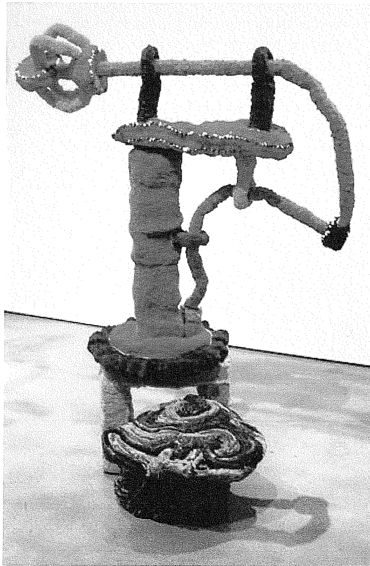
Ted Fullwood's Dialator , 2009, accompanied by Rejuvenator , 2002

Yellow Retort is a mysterious weave of many-hued yellow tubes perched on a couple of dark orbs in one corner of the installation. Its form was inscrutable to me until I saw the yellow face made up of triangular eyes and a triangular mouth, open as in speech or exercised breathing. Yellow dreadlocks bob out from the top of its head. Its yellow/orange torso turns to the right with one arm protectively poised, elbow out, in front of the chest. The dark orbs, at the bottom, are its skirt flouncing as the figure gets ready to throw a punch — or, is it dancing the “Twist”? Alternator , more abstract in the opposite corner of the installation is still a mystery to me, but funky and fun nevertheless!